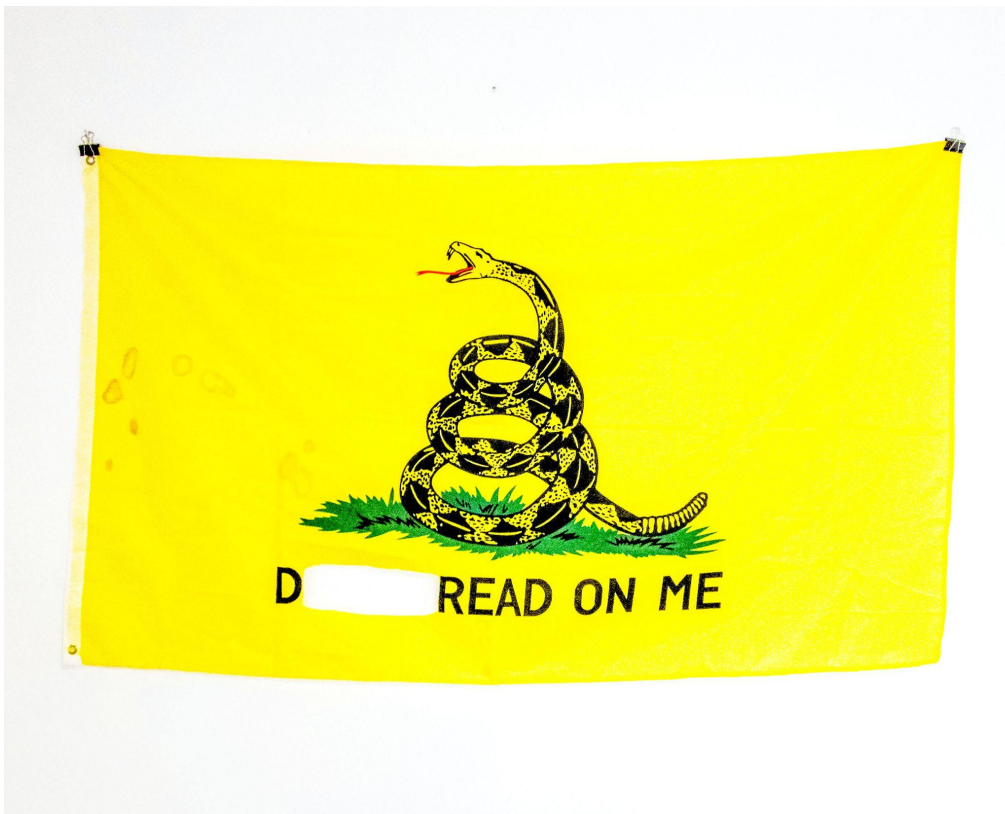
Untitled (dread on me), 2025 240D heavy polyester, canvas, brass, water stains, hardware — dimensions variable