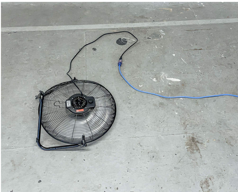
If it didn't get worse now then it's stupid, 2023 Floor fan, power cable — dimensions variable